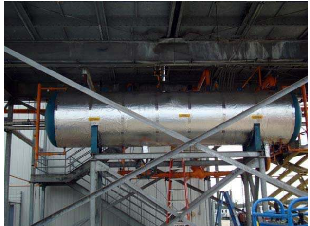
WEATHER PROTECTED VESSEL

Polyguard AlumaWrap™ is a 4 MIL cross linked polyethylene film which is laminated to a 0.7 MIL natural aluminum foil to create a WATERPROOFING MEMBRANE for uninsulated piping systems and vessels