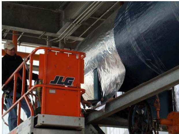
AlumaWrap™ INSTALLED OVER GeoWrap™