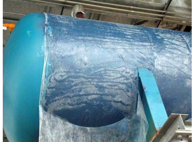
GeoWrap™ INSTALLED OVER RG