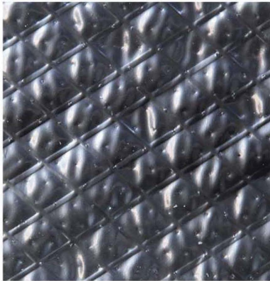
OLD VERSION OF INSULRAP 50-SJ

Insulrap™ 50-SJ-NG is the “Next Generation” of self-healing vapor barrier membranes used on insulated piping in ammonia refrigeration, oil and gas, LNG, cryogenic, tanks and vessels, and chemical processing applications.