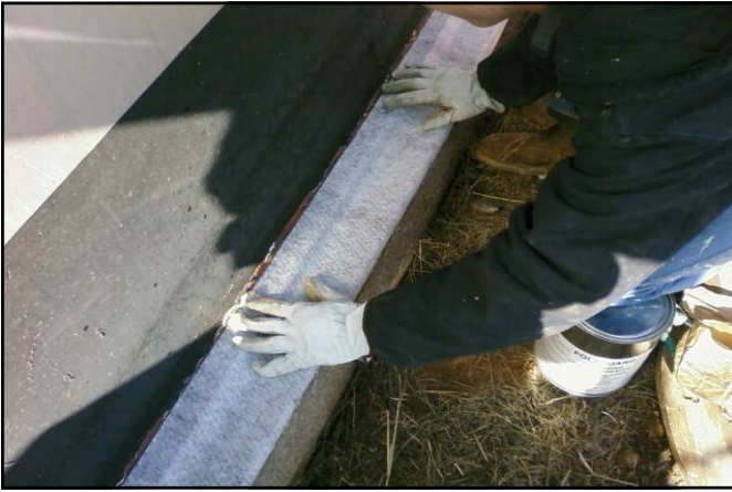
INSTALL SELECTED MEMBRANE