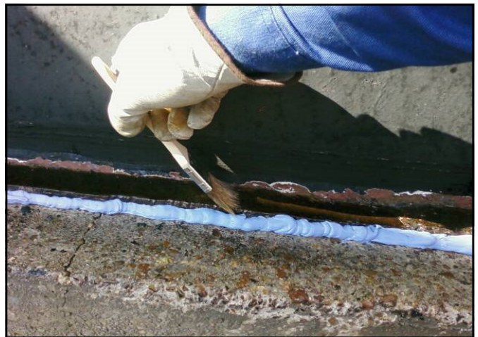
APPLY PRIMER TO CONCRETE AND METAL

P.O. Box 755 Ennis, TX 75120 PH: (214) 515-5000 FX: (972) 875-9425