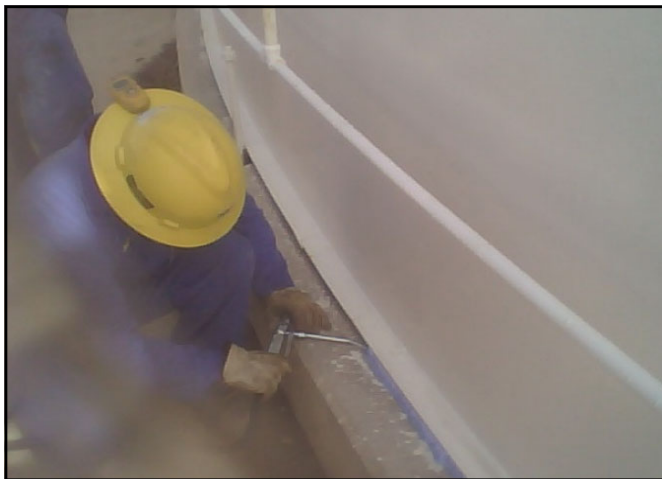
INSTALL RG-2400 AK IN CREVICE AREAS

The concept is a simple one; stop corrosion in the crevice environment where a metal vessel or tank comes into contact with a solid substrate or base. The product installation may vary as may the weather barrier over the