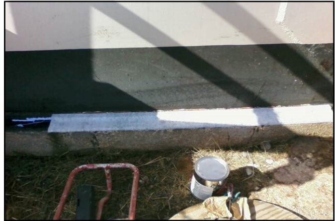
VISUAL OF FINISHED PRODUCT

installation. The process is very basic; clean the area to be treated as best as is possible (power wash, hand or power tools), dry the area (via time or temperature), inject the gel into all crevice areas, prime the metal and concrete surface and install a weather barrier for protection.