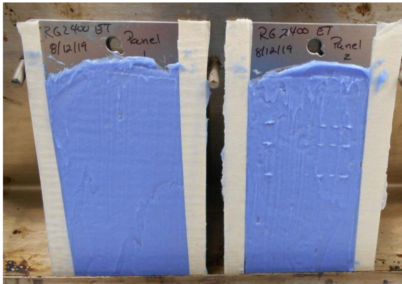
Samples prior to heat exposure

On August 19, 2019 at 3:35 pm , samples were removed from the oven.