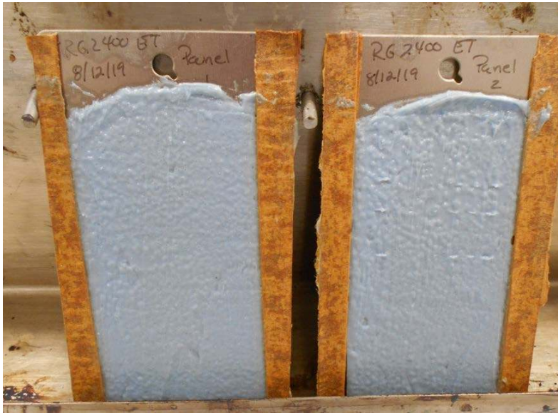
Samples post heat exposure