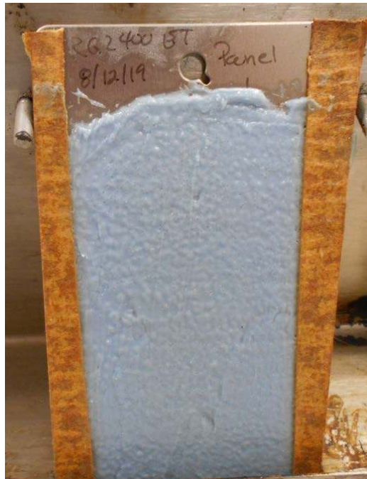
Sample 1 – post heat exposure