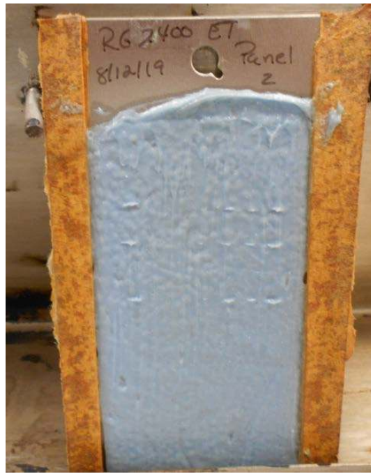
Sample 2 - post heat exposure