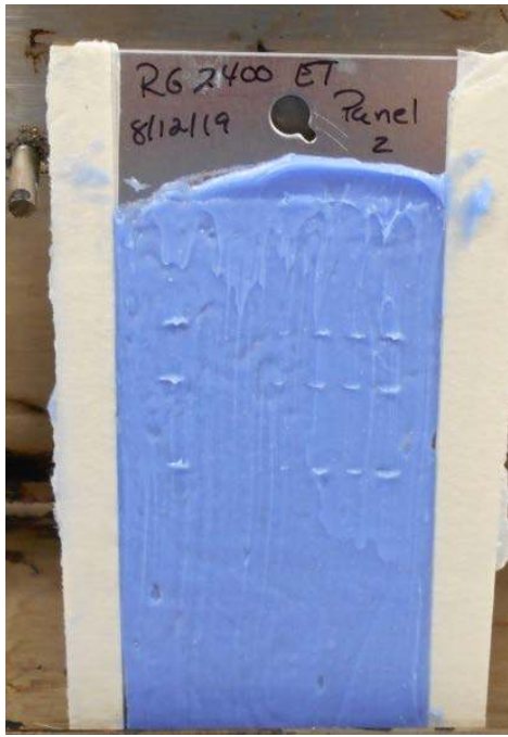
Sample 2 pre heat exposure