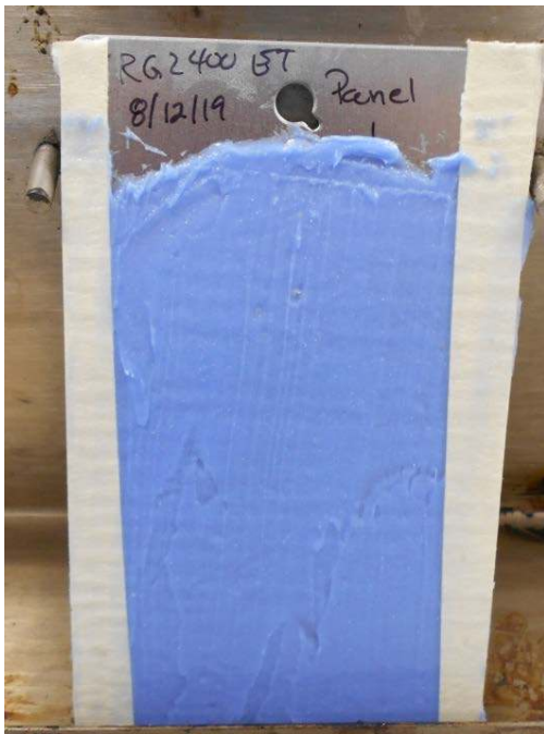
Sample 1 pre heat exposure