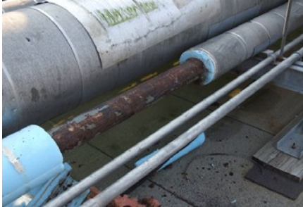
PIPE AFTER CLEANING

(this pipe required only removing loose primer)