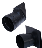
Totalflow™ End Outlet