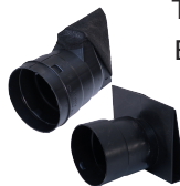
Totalflow™ End Outlet