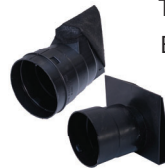
Totalflow™ End Outlet