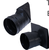
Totalflow™ End Outlet