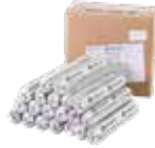
Detail Sealant PW™