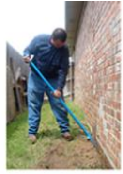
Until step is level with soil