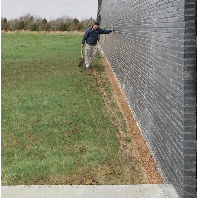
TERM Particle Barrier installed around exposed perimeter concrete at an Oklahoma hospital