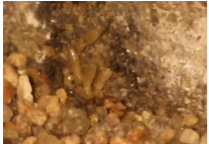
You can see a video of the failed termite efforts at the 3.00 minute mark of this demonstration video:

The picture below shows termites who had exited a structure trying unsuccessfully to reach soil because they cannot move TERM.Particles aside.